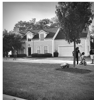
“Tuesday Evening Cricket & Biking with the Neighbors”